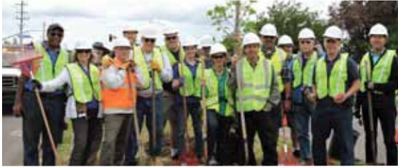
• City of Suisun Tree Donation & Planting