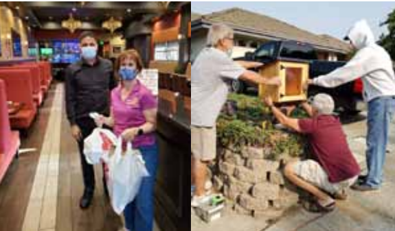
• Rotary Supports Restaurants