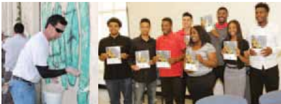
• Graffiti Removal