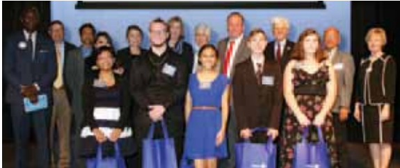
• Good Character Youth Awards