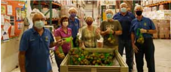
• Food Bank